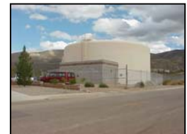
Distribution system security