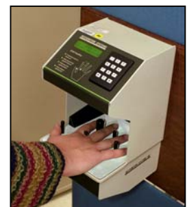
Entry control systems