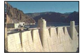
Large federal dam security assessment program